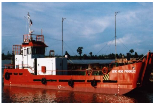
Figure 1 MV Anjang Kinship